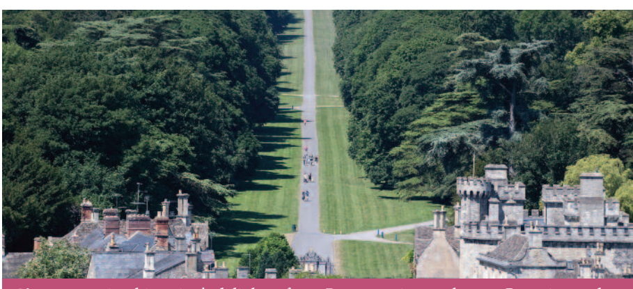
Cirencester is a historian's delight – from Roman ruins to elegant Georgian and Victorian buildings, its rich past is there to see – if you know where to look! Discover more at the award-winning Corinium Museum which, as well as having an amazing collection of Roman artefacts, traces the story of the town from prehistoric times to the modern day.