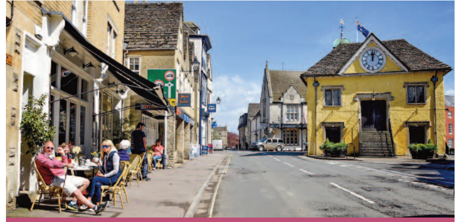
Tetbury is the second largest town in the Cotswolds. Built on the site of a Saxon hill fort, its prosperity stems from the medieval wool trade. Look up at the steep gables of the wool merchants' houses, and climb the Chipping Steps lined with weavers' cottages – architectural heritage in abundance! The town centre is a conservation area and many buildings have graded listing.