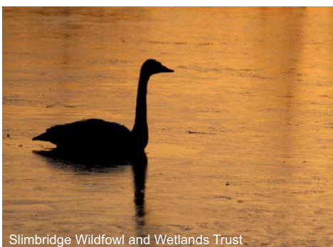
Slimbridge Wildfowl and Wetlands Trust